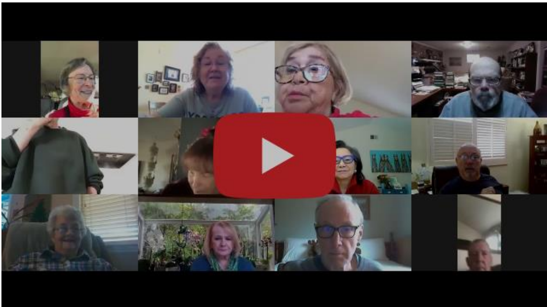
Skyline Zoom January 10, 2022