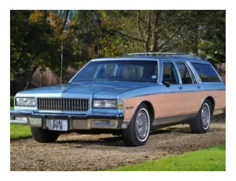
Boomer's Still Believe These Things are Groovy - What do you think?